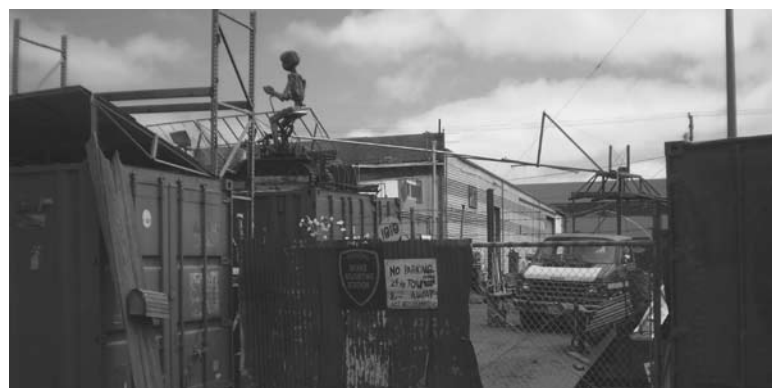
The Shipyard, birthplace of Mechabolic.

"The first internal combustion engines ran on this same type of synthetic gas, which also powered