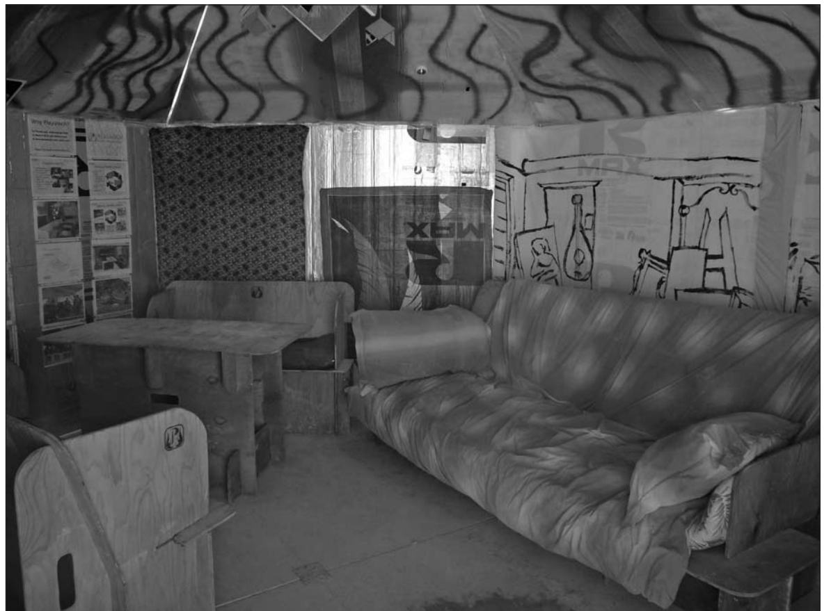
The Playatech American Dream House, furnished with the organization's slotted furniture. Below: the exterior, located near the 3:00 Promenade.

This makes the yurts ideal for flood or earthquake relief, and it is why default-world organizations like the American Red Cross, municipalities like Ontario,